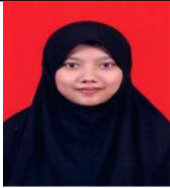
Izzatullail Arpin Lotusiana GICICPLR1710061